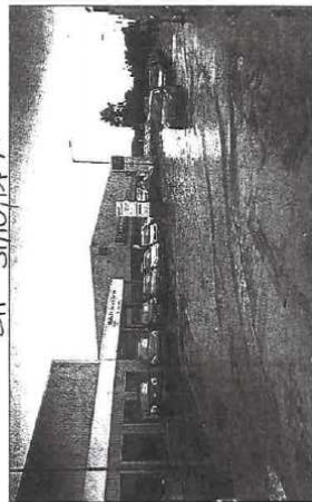
Monday's flooding in Western Road, Stratford. Pumping water away from what happened this year, a disgruntled Herald. "I've taken photos and will report if the flooded location is the fault, time that has Stratford Car Bodies, told the highway officials to illuminate the

THE road serving a Stratford industrial estate is a flooding nightmare, according to businesses. This week, firms in Western Road once again had to cope with flooding outside their premises. Although Stratford had a lucky escape from the storms that wreaked havoc in other parts of the country, the central downpour on Monday morning on Sunday made the situation on Western Road look like a minor inconvenience on some local roads. The flooding was much more obvious than Western Road which is home to many of Stratford's businesses. The water was inches deep and the business had to close their regular traffic of